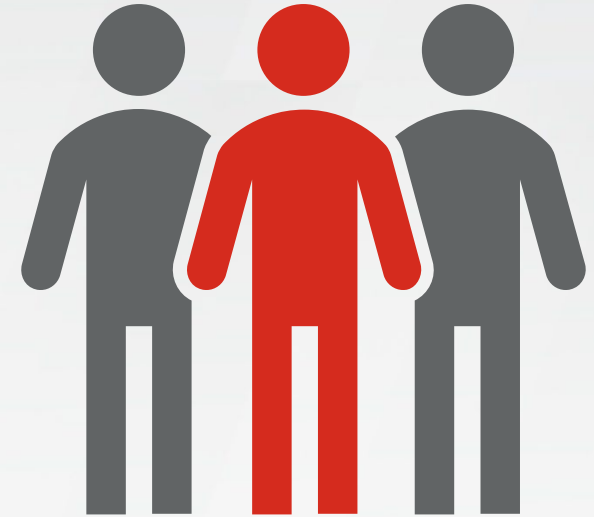
People ( A Sixth Sense of Project Management ®1 )